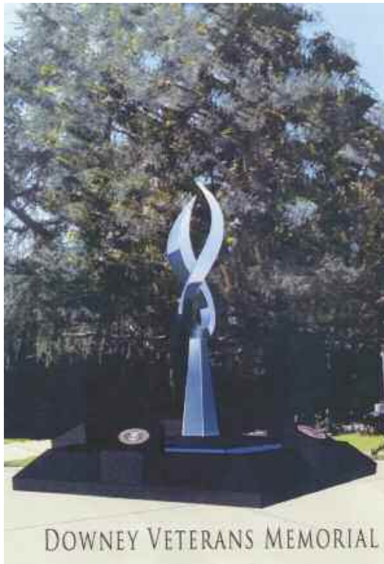
City Council members approved conceptual designs Tuesday for a veterans memorial to be installed in the Civic Center. Officials plan to install the $300,000 sculpture before Memorial Day.

The church will use proceeds from the roundup to support its youth summer camp.