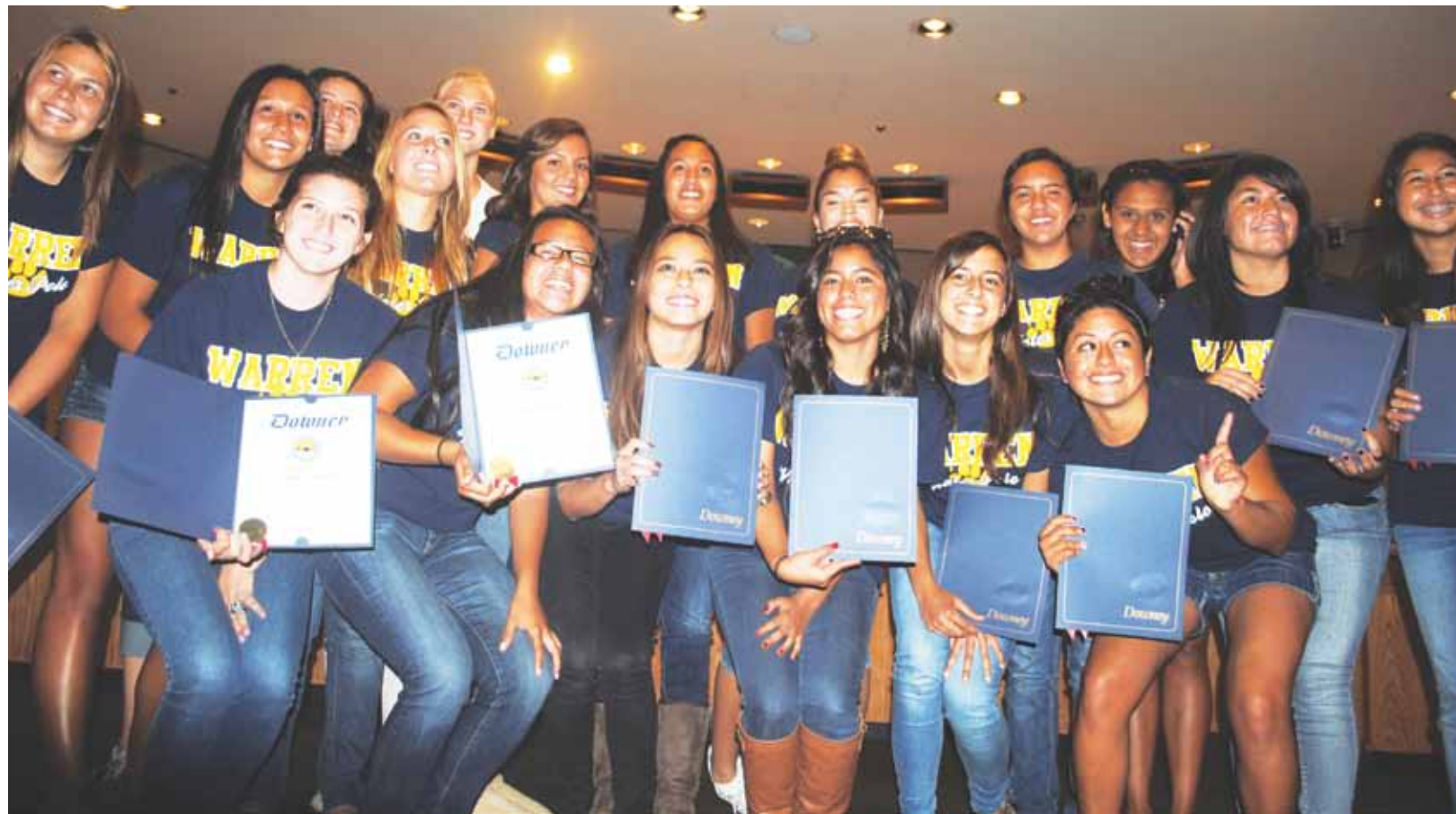
Tuesday night was all about Warren High School at City Hall, as the City Council recognized the girls water polo team for winning the CIF championship this year. It was the team's second consecutive title, the first time in school history a Warren team has won back-to-back championships. The city also honored the wrestling team for winning its own CIF championship and the solar race team, which won two first place trophies in a competition this past weekend.