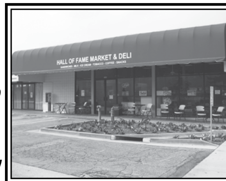
Hall Of Fame Market & Deli

IS NOW NEWLY REMODELED & UNDER NEW OWNERSHIP!