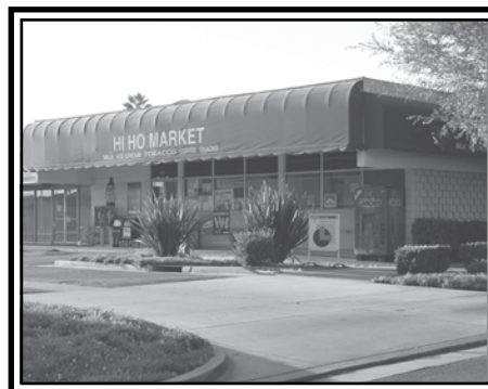
HI HO Market

IS NOW NEWLY REMODELED & UNDER NEW OWNERSHIP!