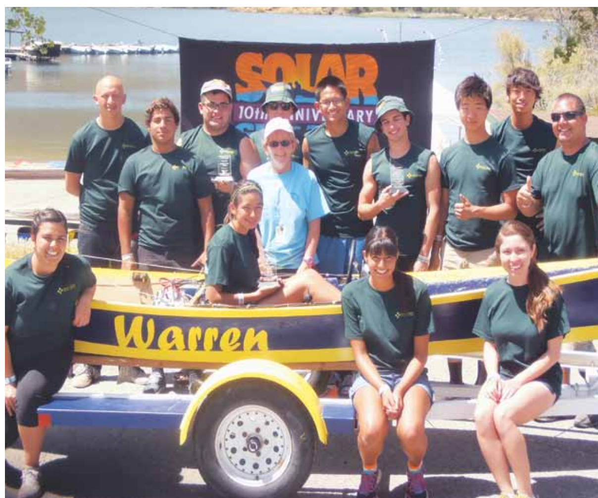
The solar boat team from Warren High School won first place in two categories this past weekend at Lake Skinner.