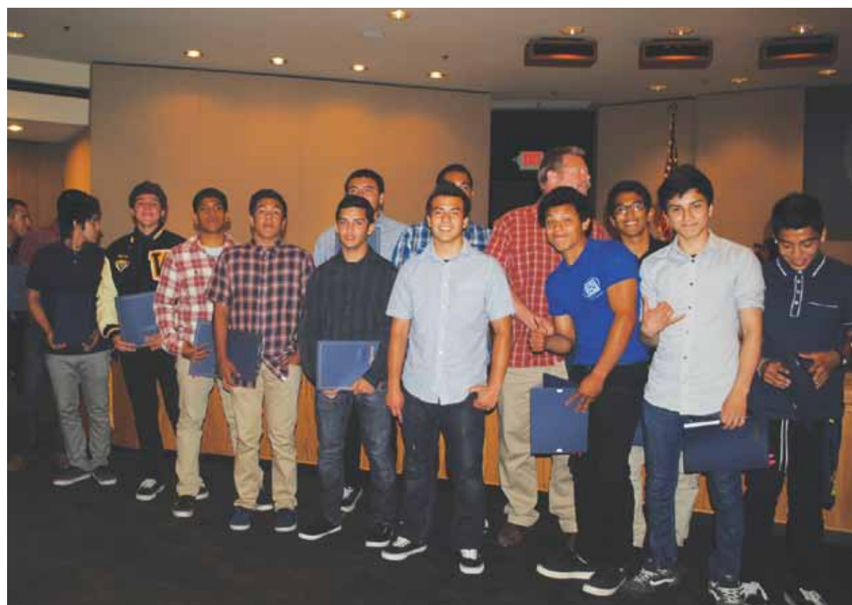
Warren High School's CIF championship wrestling team was honored at Tuesday's City Council meeting.