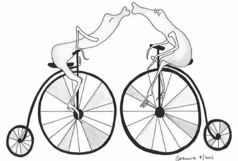
Illustration by Gennie Prochazka

So where does the quaint old-fashioned bicycle fit into this picture? If you think of the transportation system as a pressure cooker building