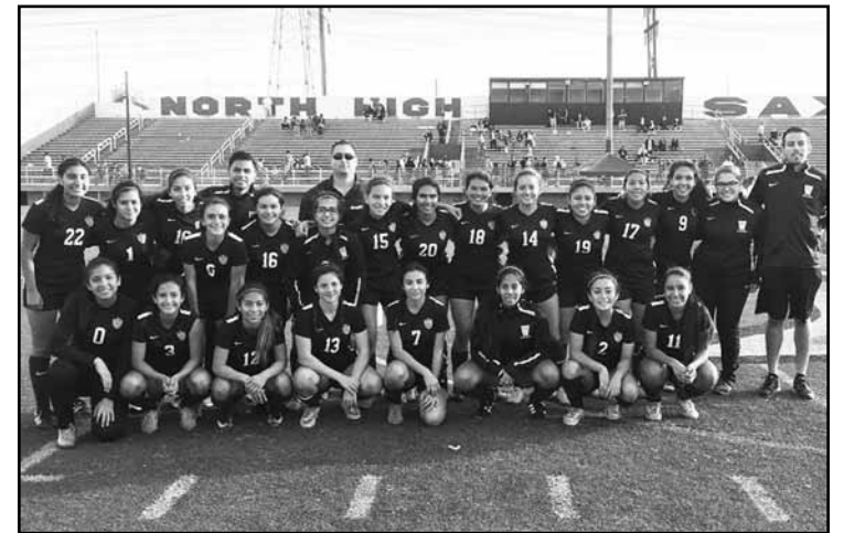
Warren High's girls soccer team, ranked No. 2 in Div. III by CIF Southern Section, defeated North Torrance to advance to CIF quarterfinals.