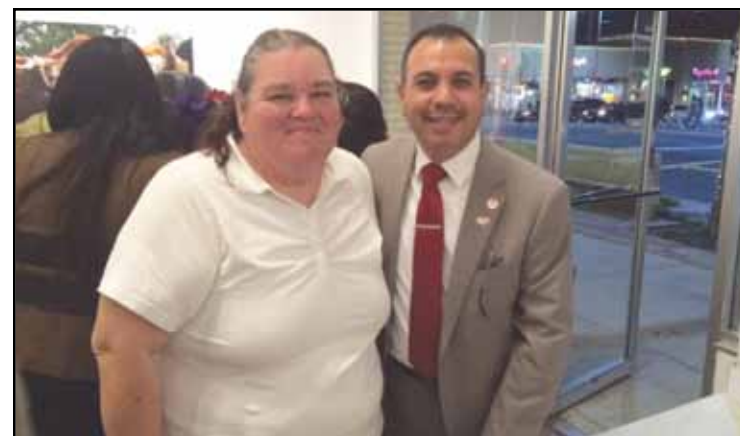
The Downey Sister Cities Association hosted the 53rd U.S.-Mexico Sister-Cities National Convention this past weekend.