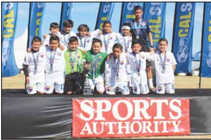
Total Futbol Academy's BU9 blue team went undefeated their entire season and won the Cal-S State Cup Tournament, winning the championship match, 3-0.

"It's what every team strives for at the beginning of the year and fortunately through hard work, great development, great team chemistry, great support from the parents, the year-long journey culminated with a state cup championship win," the team's coaches said.