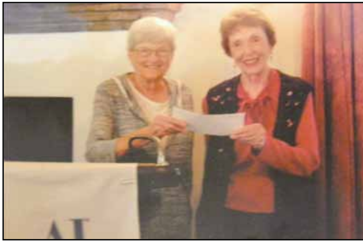
The Assistance League of Downey received a $5,000 grant from Southern California Edison in support of the Assistance League's Operation School Bell program, which provides clothing to at-need Downey students in partnership with Kohl's.

"It's what every team strives for at the beginning of the year and fortunately through hard work, great development, great team chemistry, great support from the parents, the year-long journey culminated with a state cup championship win," the team's coaches said.