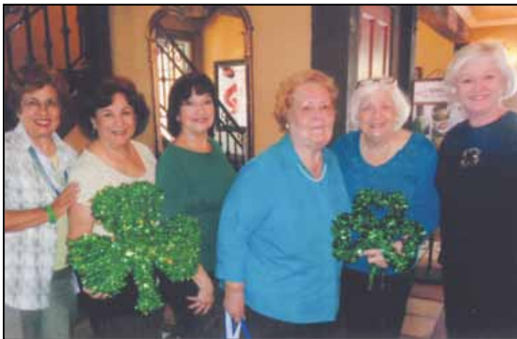
The OLPH Women's Guild past president's champagne luncheon will be held March 12 at 11 a.m. at the Rio Hondo Event Center.

The meeting begins at noon and is open to the public.