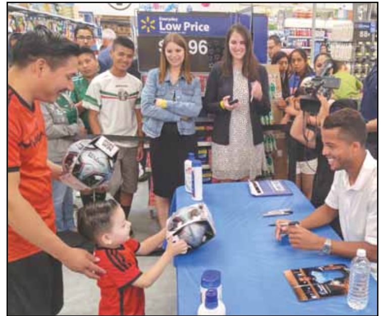
Mexican soccer star Giovanni dos Santos was at the new Downey Walmart on May 17 to meet fans and sign autographs.

For more information, or to contact an agent, call (562) 861-7257.