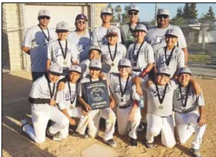
The Downey Royals of the L.A. Baseball Academy finished the playoffs 13-1 to win the league championship.

Details on RERF can be found at www.rerf.jp/index_e.html