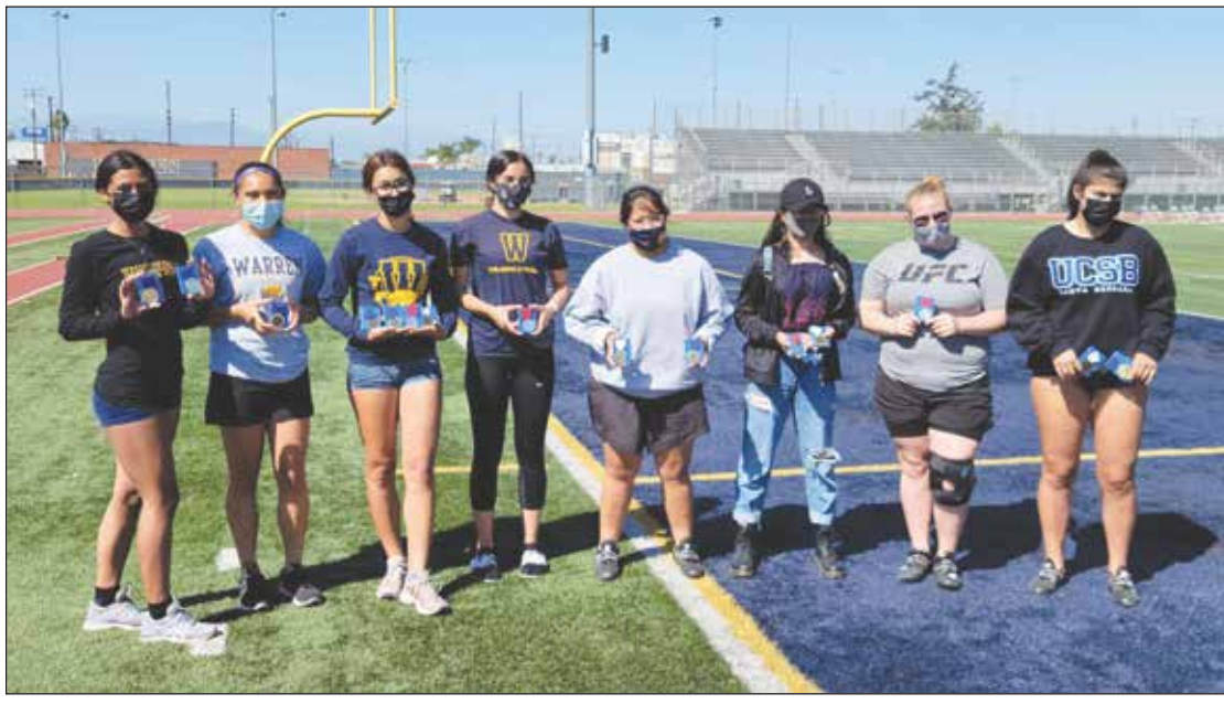
Warren High won its first track and field San Gabriel Valley League title in five years. At league finals last Friday, Warren won more championship events than any other school.

The board recently adopted a budget and district reorganization that will realize nearly $1.2M in annual operating savings starting with the 2021 budget year; this year the District could realize a nearly $2.5M net operating margin. The District's monthly average operating cash and unrestricted reserves are at levels not seen since 2016, with the District making contributions to its unrestricted budget reserves further stabilizing its long-term financial outlook.