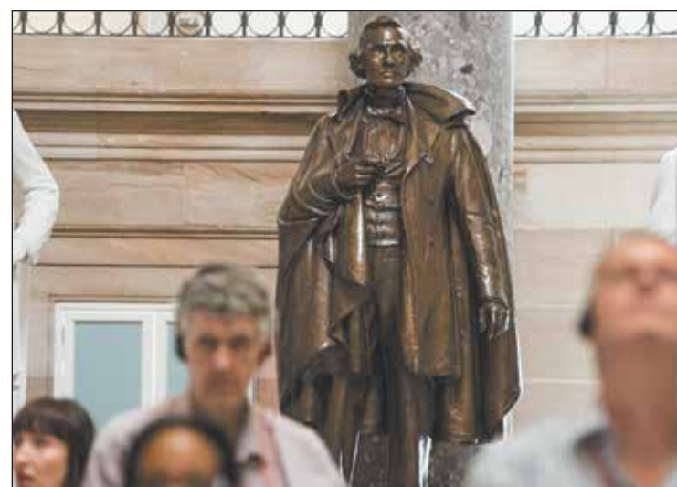
Mississippi's statue of Confederate president Jefferson Davis stands in Statuary Hall in the U.S. Capitol.

Justice Thurgood Marshall is widely considered one of the most consequential civil rights leaders in American history. After establishing the NAACP Legal Defense and Educational Fund, Marshall went on to successfully argue a number of cases before the Supreme Court, including the bedrock Brown v. Board of Education case that