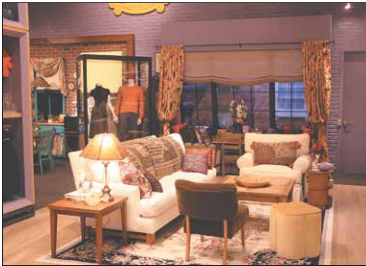
The "Friends" set was recreated on Warner Bros.' new studio tour.

The grand finale of the tour will see guests enter into "Action and Magic Made Here,"